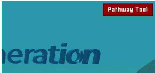
Button leading to the Pathway Tool

Having this feature also allows for people who are curious, to input any number they please and browse the jobs the system finds. The database will use the inputs and calculate in the same manner as it would, had the player completed the games.