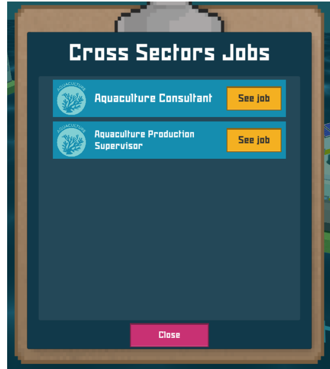
Choosing a cross-sectoral job opens a new job card